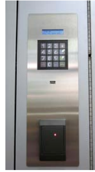
Touchpad interface with USB interface and protected LCD display