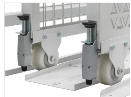
BUILT-IN FOOT BRAKE