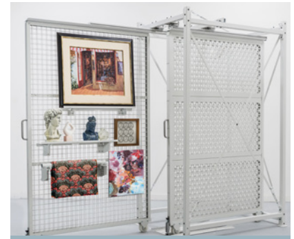
SCREENS FULLY EXTEND