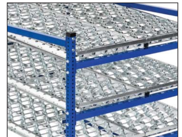
SpanTrack Bed HD (1.9" steel)