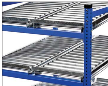
SpanTrack Lane HD (1.38" steel)