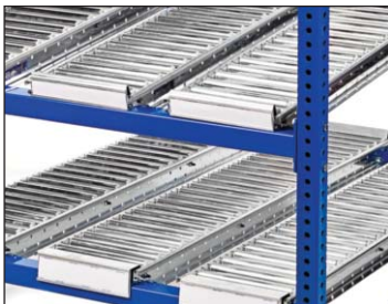
SpanTrack Lane (0.75" aluminum)